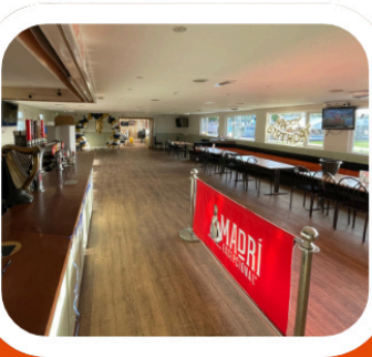
THE VICTORY SUITE

VENUES START AT JUST £40 PER HOUR, WHICH INCLUDES STAFFING AND FULL BAR SERVICE.