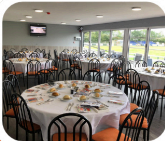
THE NELSON ROOM