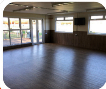
THE WARRIOR SUITE