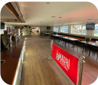
THE VICTORY SUITE

VENUES START AT JUST £40 PER HOUR, WHICH INCLUDES STAFFING AND FULL BAR SERVICE.