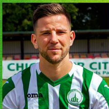
CA Plant & Materials