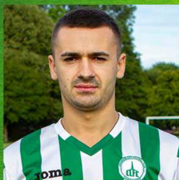
Bridge Construction Southern Ltd