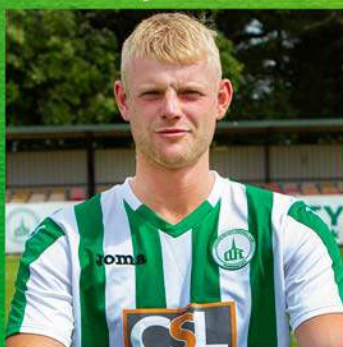
Concise Surfacing Ltd