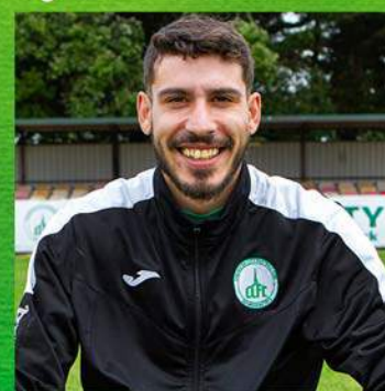
University Of Chichester