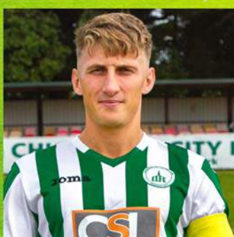
Available call 07856 158360