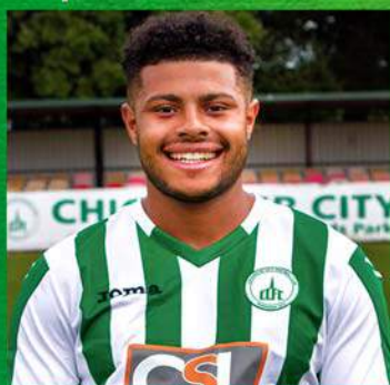
Bridge Construction Southern Ltd