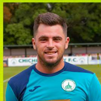
Available call 07856 158360