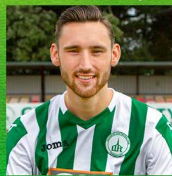
Coversure Insurance Services