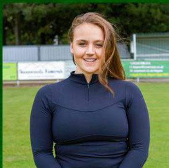
University Of Chichester