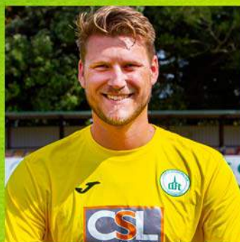
Available call 07856 158360