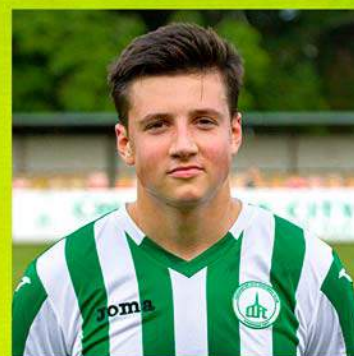
Available call 07856 158360