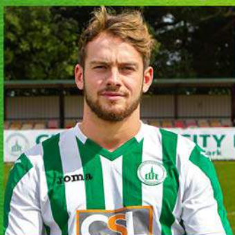
BMS Southern Ltd