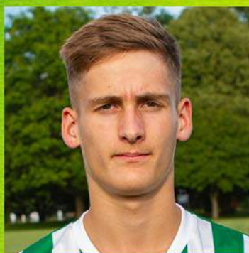
Chichester City Youth FC