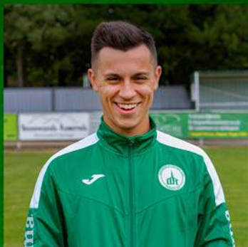
University Of Chichester