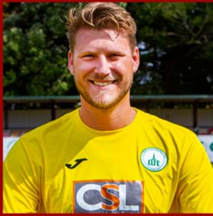
ANT ENDER AVAILABLE