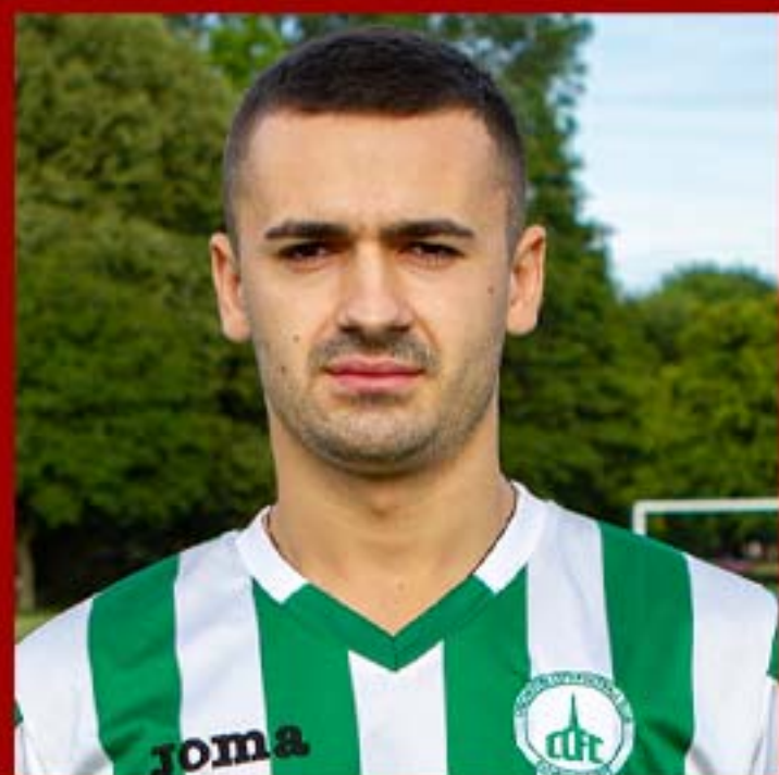
GICU IORDACHE BRIDGE CONSTRUCTION LTD