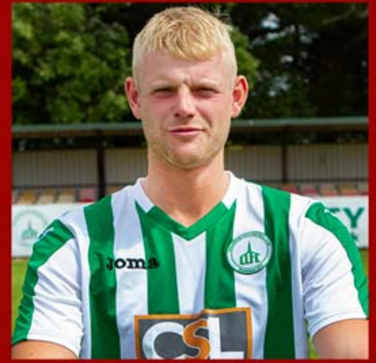
COREY HEATH CONCISE SURFACING LTD