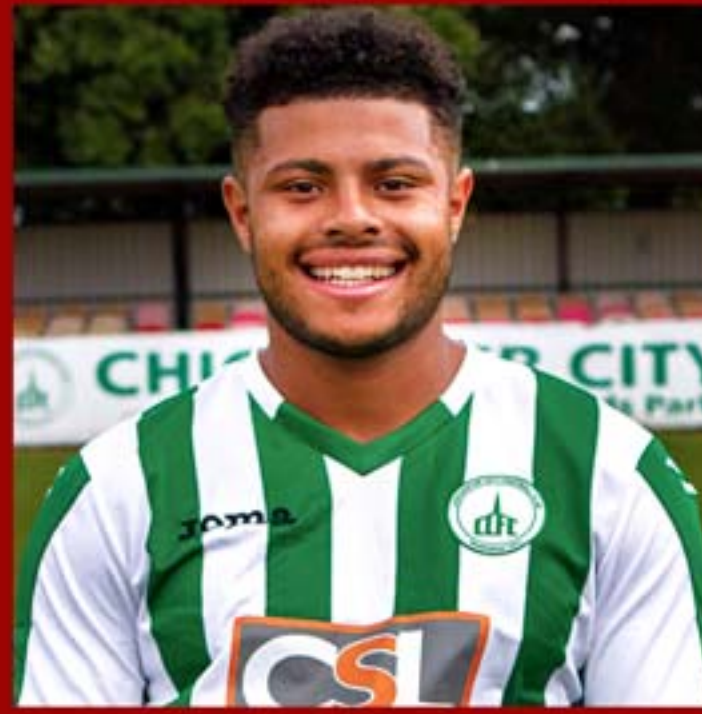
RYAN DAVIDSON BRIDGE CONSTRUCTION LTD