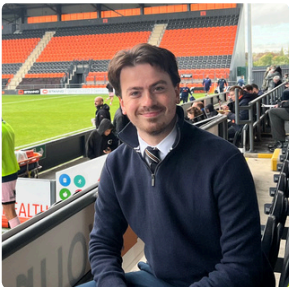
DIRECTOR'S BLOG - ALEX CROWTHER