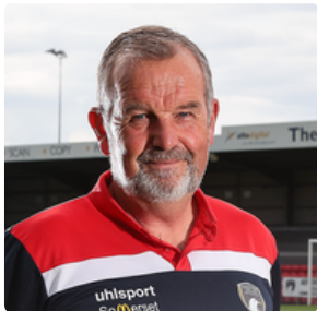
DIRECTOR'S BLOG - SIMON PANES