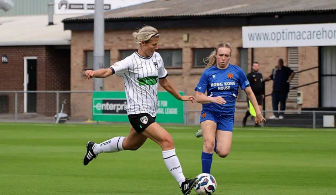
Action from the Women's team's 3-2 defeat to Corsham Town in the FA Cup at the Optima Stadium on Sunday, 7th September.