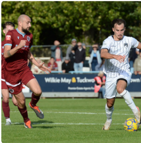
📷 FROM TAUNTON TOWN (AWAY)