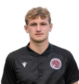
'THE PEACOCKS' - FOUR TO WATCH