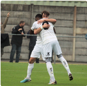
ON THIS DAY - SEPTEMBER 16TH