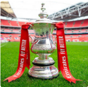
FA CUP/NLS ROUND-UP