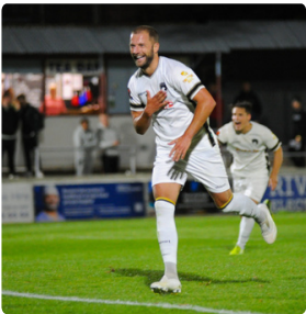
HEAD TO HEAD - CHESHAM UNITED