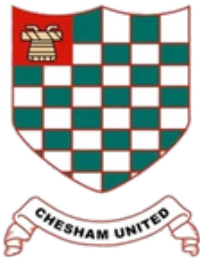
'THE GENERALS' - FOUR TO WATCH