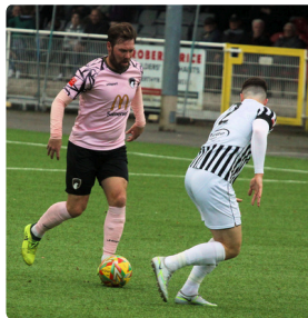
ON THIS DAY - 11th OCTOBER